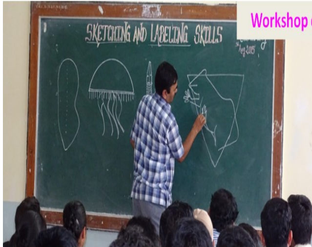
Workshop on Sketching & Labeling Skills in Zoology