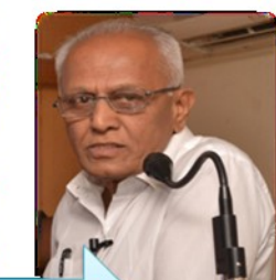
Hon. Speakers of the national seminar ..... Enthralled audience..... Paper presentation by the participant..... Distribution of certificates