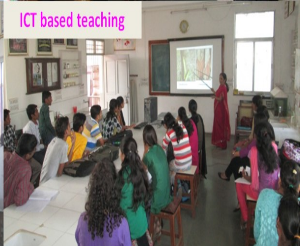
ICT based teaching