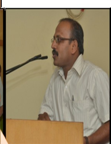
Hon. Speakers of the national seminar ..