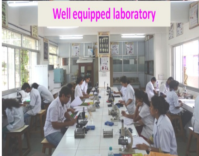
Well equipped laboratory