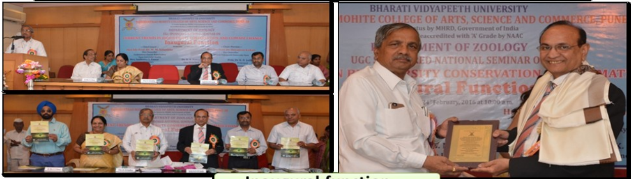
Inaugural function ...