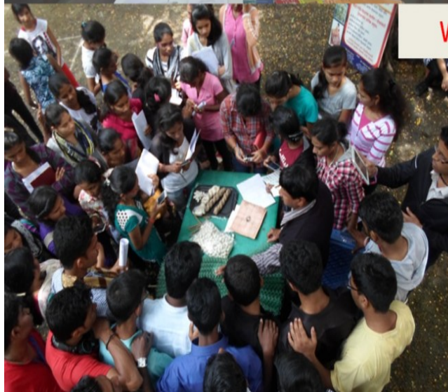
Visit at Wai sericulture center