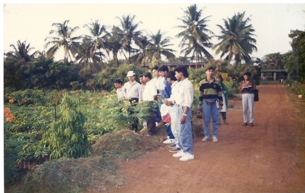
Study Tour at Kokan Krushi Vidyapeeth, Dapoli