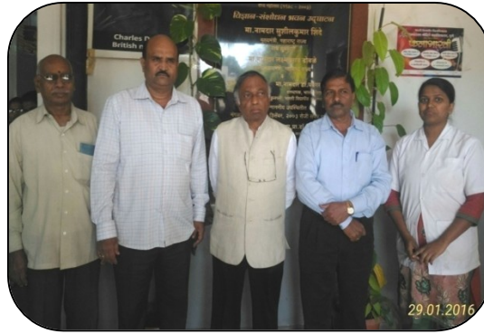
Padma Shri and Padma Bhushan Hon'ble Dr. Vijay Bhatkar, (29 th January 2016).