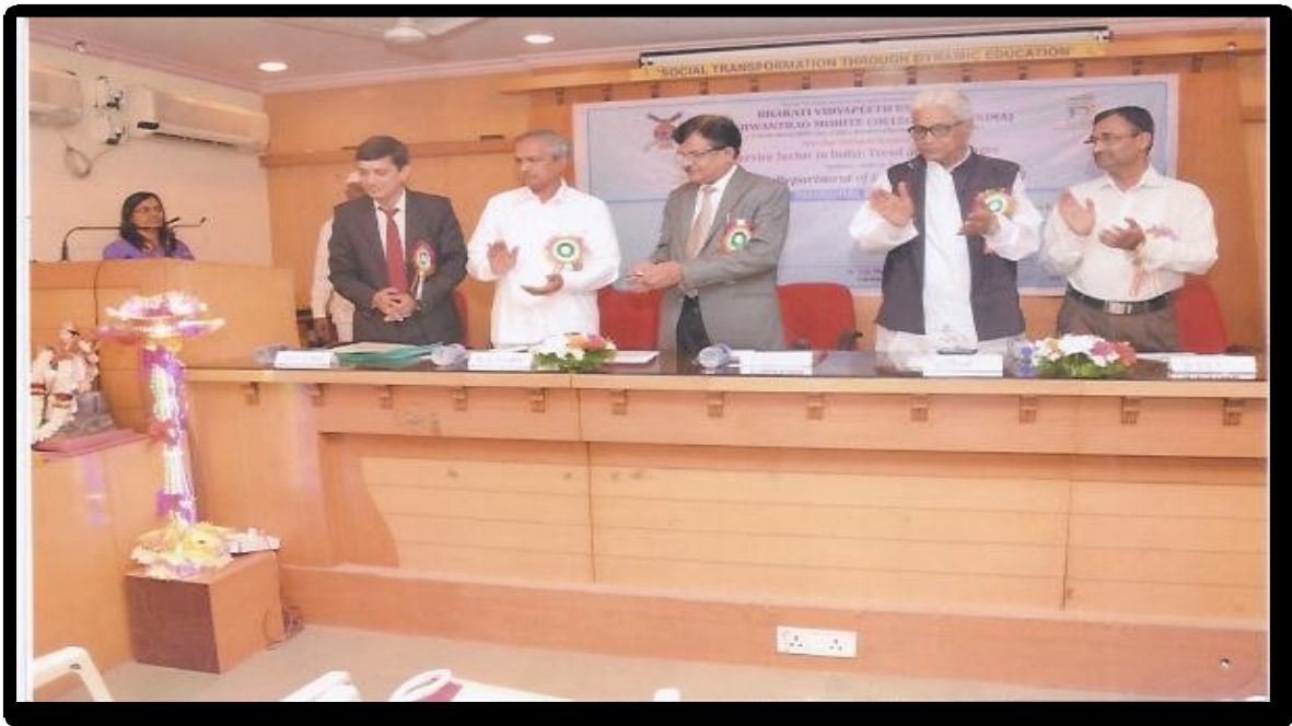
UGC sponsored National Seminar on 'Role of Service Sector in India' 11 th March 2015