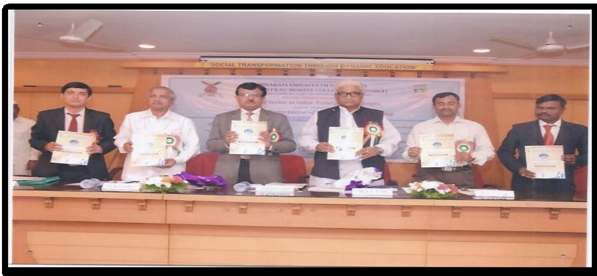
Souvenir publication by the hands of Chief Guest and other dignitaries