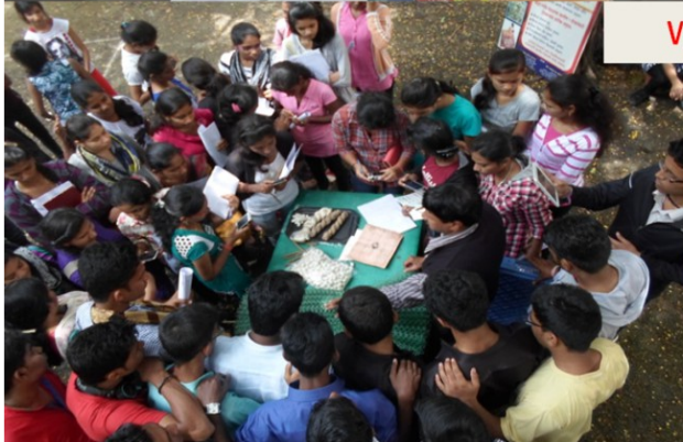
Visit at Wai sericulture center