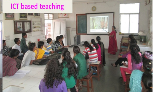
ICT based teaching