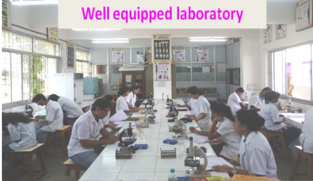
Well equipped laboratory